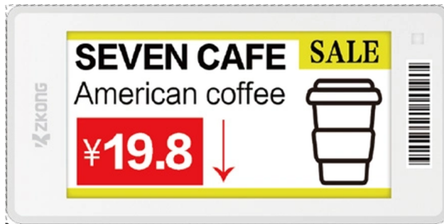
ZKC26S · 83 × 41 mm