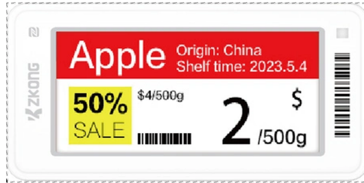
ZKC21S · 70 × 34.5 mm