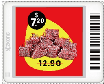
ZKC15S · 44.5 × 35.9 mm