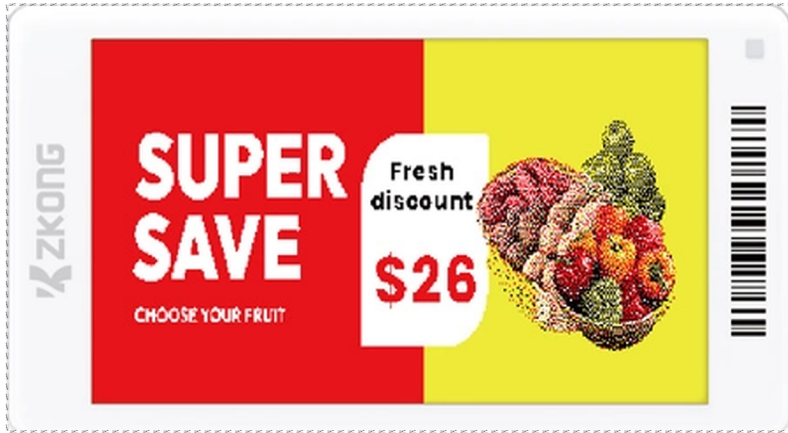
ZKC37S · 104 × 56.4 mm