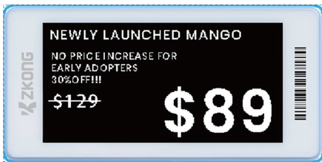
ZK26SF · 83 × 41 mm