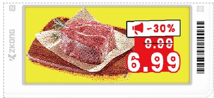
ZKC29S · 90 × 41 mm