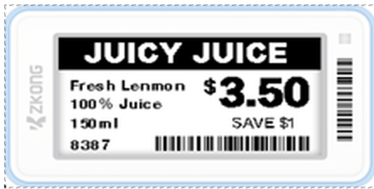
ZK21SF · 70 × 34.5 mm